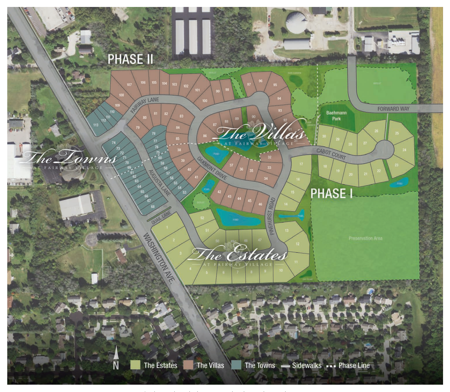
Rendering is deemed to be accurate and is subject to change without notice. Please refer to recorded documents for more details.